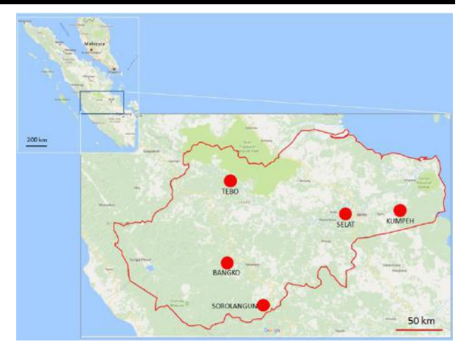
Fig. 1. Sampling sites of original cultivar from Jambi (Modification from:https://www.google.com/maps/place/ Jambi,+Indonesia)

Total fifteen samples of duku were gatherred from five center localities for duku ( Lansium parasiticum ) production of in Jambi area, there were Bangko (BK04, BK 10 and BK 19), Tebo (TB 03, TB 11, and TB 14), Kumpeh (KP15, KP17 and KP25), Selat (SL16, SL17 and SL18), and from Sorolangon (SR03, SR10 and SR18) represented duku accessions native in Jambi (Figure 1). The young leaves of duku trees were grinded and DNA extraction was performed using CTAB (cetyl trimethyl ammonium bromide) method [13]. The fresh young leaves about 0.1 mg were finely grinded. The resulting DNA isolation were amplified using the primers of two barcode DNA, ITS and MatK.